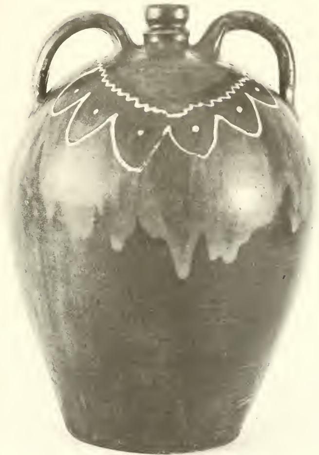
Jug by the Phoenix Factory; alkaline-glazed stoneware; Edgefield area, S.C.; 1840-1842. HOA 16 \frac{5}{8} ". MESDA acc. 1054.3.